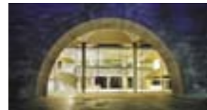
NGV moves to St Kilda Road