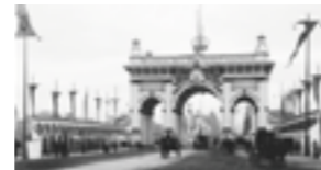
Corporation Arch, Princess Bridge