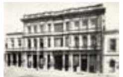
Law Institute of Victoria